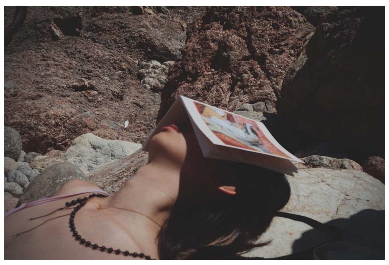
My "able-body" Friend is Having a Fever